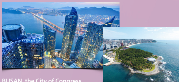
BUSAN, the City of Congress

BEXCO (Busan Exhibition and Convention Center), a proud landmark convention center of Busan, is located in the heart of the Haeundae convention district. As the world's 3rd most surprising convention centers of rapid growth' in the past ten years (UIA, 2011), BEXCO boasts its world class facilities in harmony with outstanding natural environment.