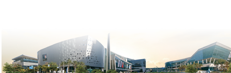
BEXCO, the venue for APICA 2018

BEXCO (Busan Exhibition and Convention Center), a proud landmark convention center of Busan, is located in the heart of the Haeundae convention district. As the world's 3rd most surprising convention centers of rapid growth' in the past ten years (UIA, 2011), BEXCO boasts its world class facilities in harmony with outstanding natural environment.